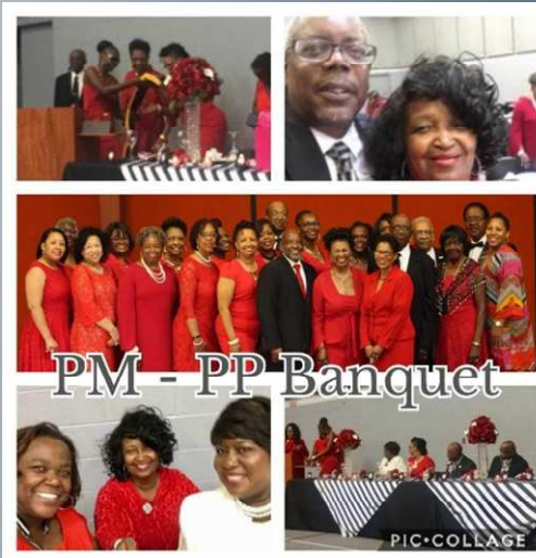
PM - PP Banquet